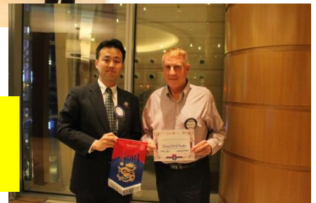
Presenting the Certificate of Recognition by the Rotaract Club to the RC Shanghai